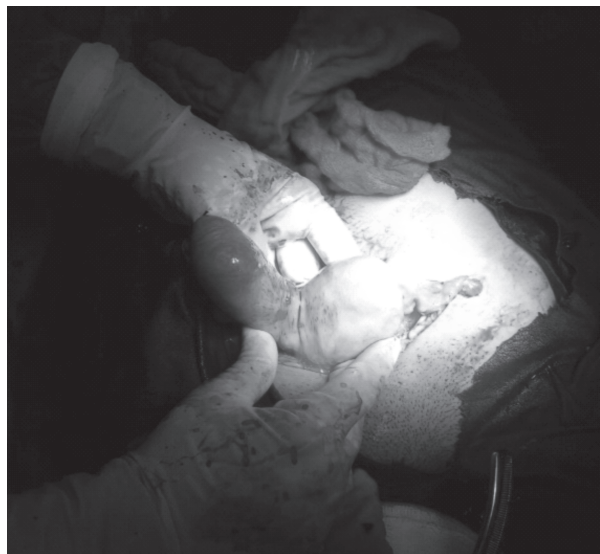
Figure 1: Rupture right rudimentary horn

Upon assessment, the woman had a fast, weak pulse, significant pallor, and was in hypovolemic shock. There was no way to record her blood pressure. The uterine size could not be seen, and the abdomen seemed stiff and swollen. Upon pelvic examination, there was cervical movement pain and fornix fullness. No vaginal bleeding was seen. After resuscitation, the patient was sent immediately for a laparotomy due to her shock. She had 3 grams of hemoglobin when she had her laparotomy.