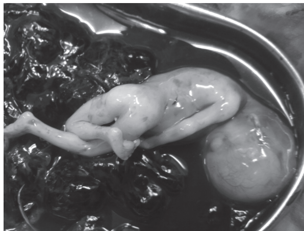
Figure 3: Fetus with placenta and clots

The right rudimentary noncommunicating horn of the unicornuate uterus ruptured during the laparotomy (Figure 1). This let the fetus and placenta float freely in the peritoneal cavity and caused about three liters of hemoperitoneum (Figure 2). About 600 grams was the fetus's weight (Figure 3). The crude horn was removed. The abdomen was kept drained and then closed in layers until hemostasis was achieved. Five blood units were transfused into the woman. She made a wonderful recovery after her surgery. Later, when her urinary system was examined, no abnormalities were discovered. After eight days in the hospital after her surgery, she was released.